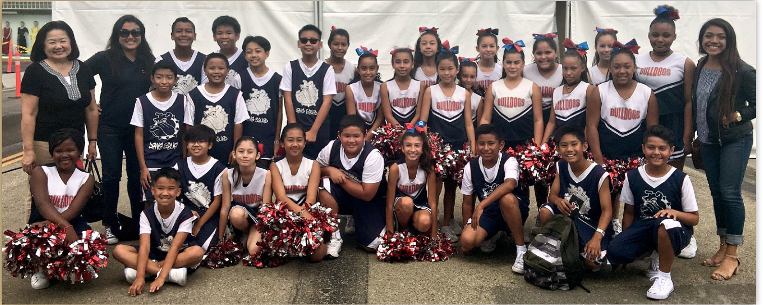
Burbank ES Spirit Squad and Dawg Squad

The Artesia International Street Fair and Diversity Festival on October 6 was festive and included performances from our schools including the Ross MS Choir, Whitney HS's Kokoro Kara Taiko Drummers, and Burbank ES's Spirit Squad and Dawg Squad. It was great to see these fine performances, eat local cuisine, and speak with members of the community at the Fair and Festival. ▶