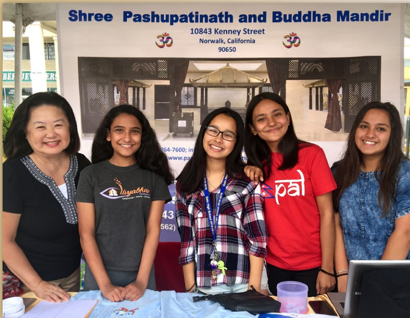
Gahr HS Nepalese Students