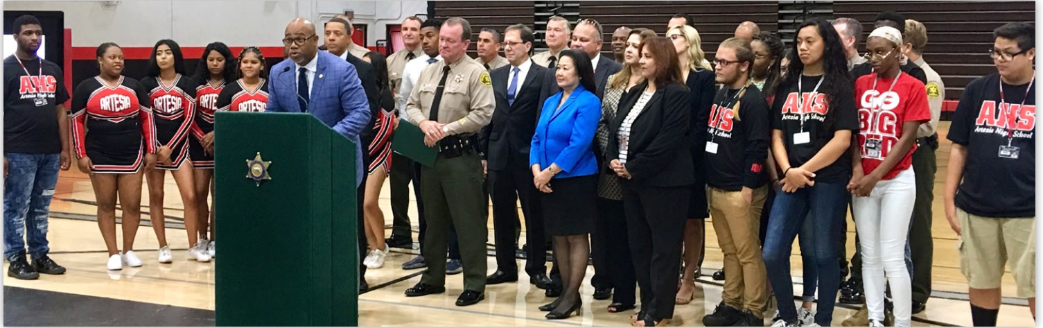
POP Press Conference at Artesia HS

On September 27, our District held a major Press Conference in Artesia HS's Gym to present the "Pull Over Protocol (POP)" Program. The Pull Over Protocol is the strategic collaboration between proactive civilians and local, regional, and national law enforcement agencies. The purpose of POP is to educate the general public through a dramatic course of practical pull over procedures intended to equip law abiding citizens with detailed police department expectations. The result is designed to produce more successful law enforcement/civilian interactions to ensure the safety of all parties.