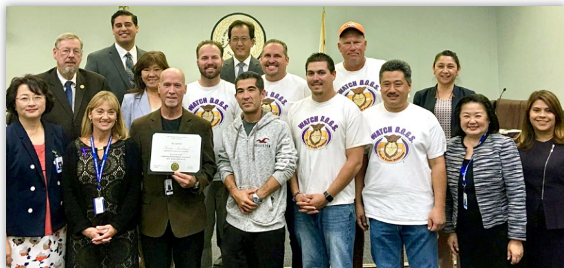
Board of Education Honors Nixon ES Academy on Winning a Golden Bell Award for their Watch D.O.G.S. Program

The Committee must include all of the following: a) One member who is active in a business organization representing the business community located within the school district; b) One member active in a senior citizens organization; c) One member active in a bona fide taxpayer association; d) One member shall be the parent or guardian of a child enrolled in the district; and e) One member shall be both a parent or guardian of a child enrolled in the district and active in a parent teacher organization such as the PTA.