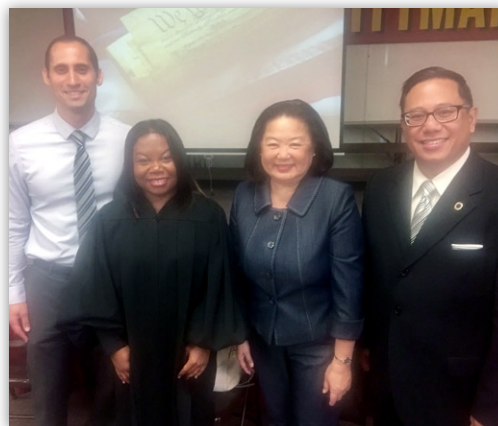
Wittmann ES Constitution Day