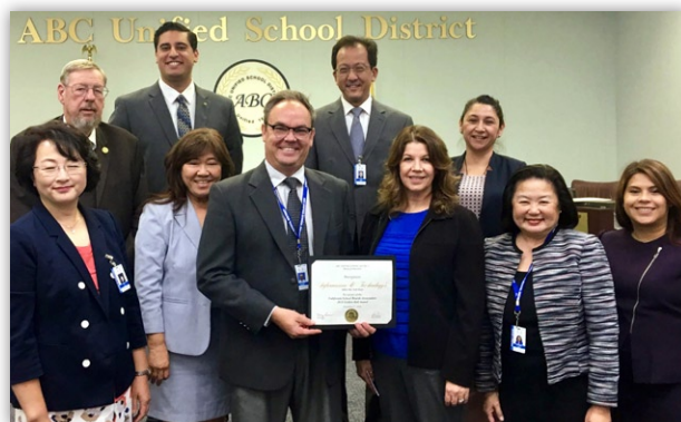
Board of Education Honors Yellow Bus Tech Tours for Winning a Golden Bell Award from CSBA

The purpose of the Committee shall be to inform the public at least annually concerning the expenditure of the bond proceeds. In addition, as required by State law, there will be two separate audits by an independent auditor. There will be a Financial Audit that will be on the proceeds from the sale of the bonds as well as a Performance Audit that will be to ensure that the bond funds have been expended only on the specific projects listed in the bond measure.