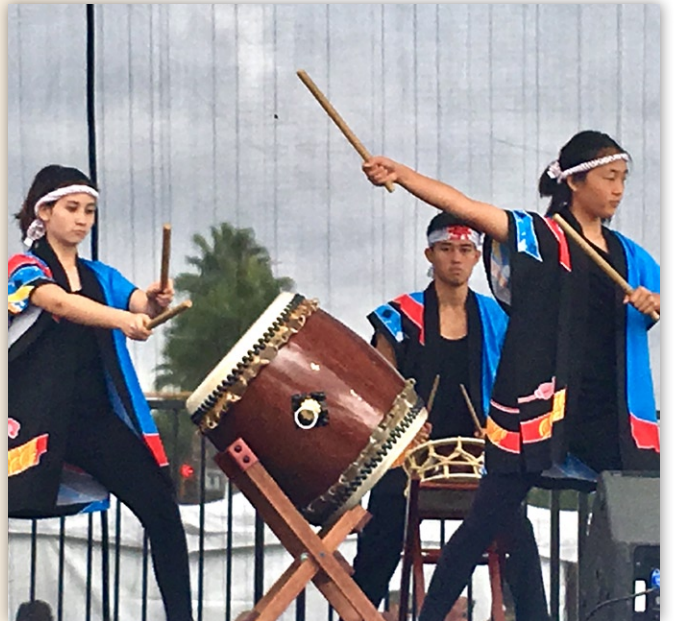
Whitney HS Kokoro Kara Taiko Drummers